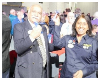
The International Convention in Melbourne.