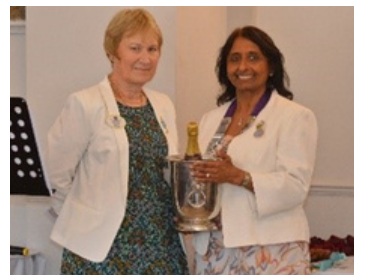
Handover and official start to DG duties.