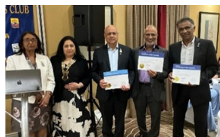
2 new members inducted at London Central Host.