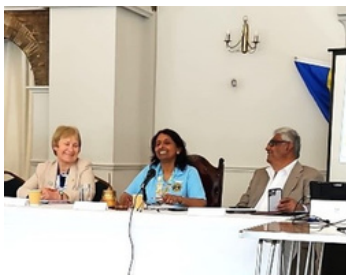
First half cabinet meeting.