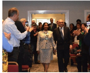
Elected as DG at our District Convention.