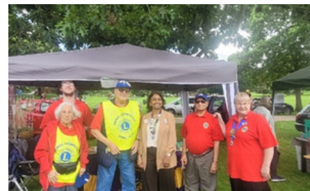
Lark in the Park at Hemel Hempstead.