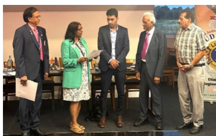
3 New members inducted at Sudbury Lions Club.