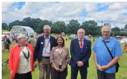
Harpenden Highland Gathering.

Find out what our DG has been up to recently