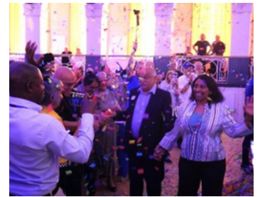
MD Convention walk-in as DG.