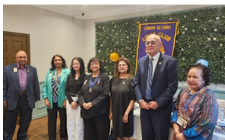
Induction of a new member and installation of officers at London Belmont Lions Club.