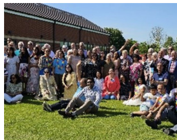
DG Garden Party.