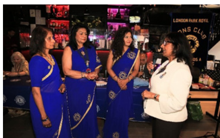
Installation of officers in Park Royal Lions Club.