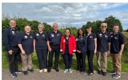
2024-2025 MD Council of Governors.