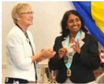
Elected as DG at our District Convention.