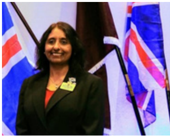
Elected as 2nd Vice District Governor.