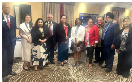
London Central Host – 74th Charter Celebrations and Installation of Officers.