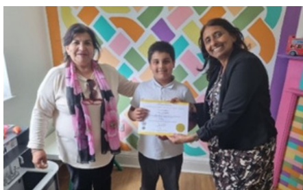
108 Young Leaders in Service Certificates to Valence Primary School on behalf of Fairlop Lions Club.