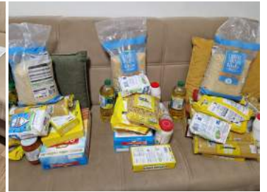
Waltham Forest Lions Club delivered food parcels (non-perishable food items) around the Walthamstow area.