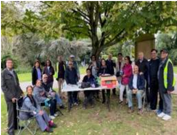
London Platinum Jubilee Lions Club sponsored Charity Walk and Picnic in September at Rickmansworth Aquadrome.

It's been another busy but brilliant year for the Lions. Across our District, every Club has worked hard to raise funds for various charities and serve our communities with passion and enthusiasm. While we wish we could highlight every single effort in this section, this issue of Pride of Lions would be super long if we did! Instead, we're excited to showcase a selection of the incredible fundraising and service activities that took place this year.