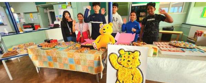
Heston Lions Club delivered Hummingbird Bakery cakes to the children at Dormers Wells Junior School for their BBC Children in Need fundraising efforts.