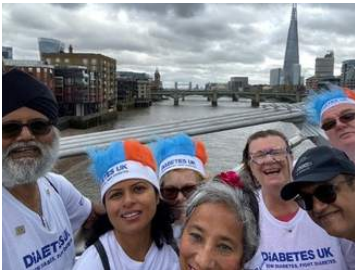
Members of Harrow and Pinner Lions and partners in the five mile walk to raise money for Diabetes UK, raising £970.