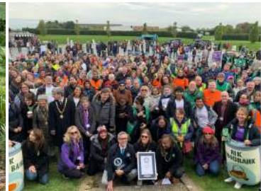
Newport Pagnell and Olney Lions Club supported MK Food Bank in a successful attempt to break the world record for the longest line of cans of food, surpassing the previous record with over 100,000 tins.