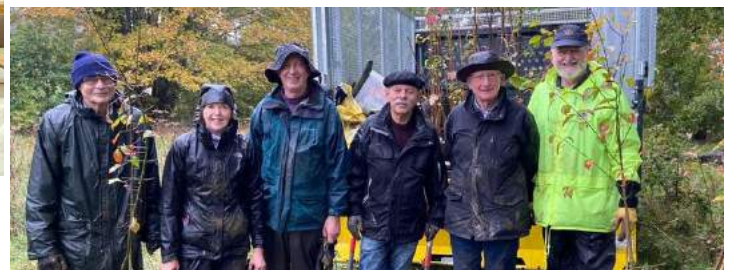
Harpenden Lions planted 54 native trees to create a new woodland area in Rothamsted Park.