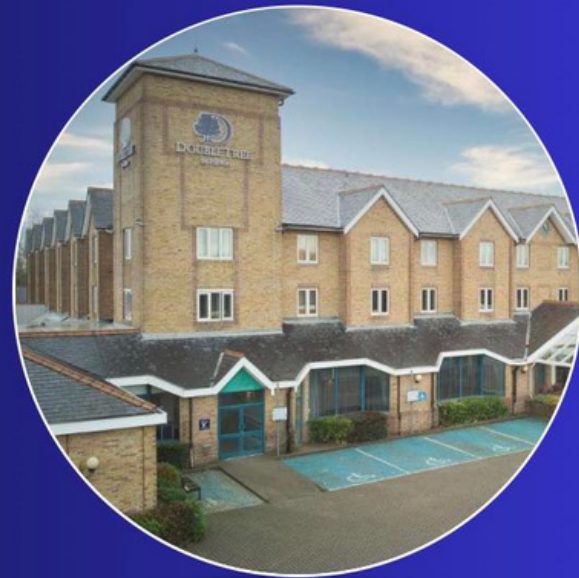
📍 Double Tree Hilton Elstree - Barnet By-Pass, Borehamwood WD6 5PU